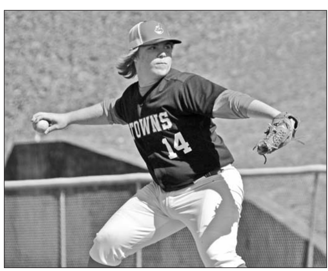
Towns County baseball