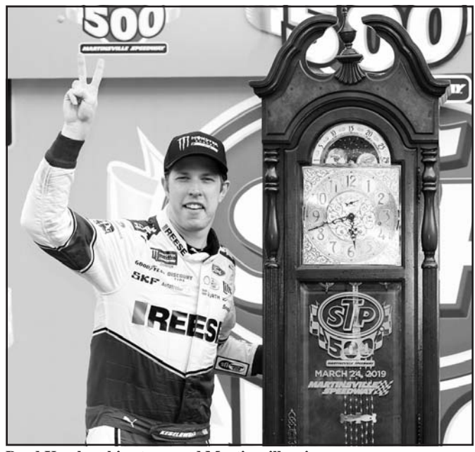
Brad Keselowski gets second Martinsville win

Busch was running in fifth place by lap 274 and in fourth by lap 289. He quickly reported that the changes made earlier by his team were ineffective. While the handling was not perfect, it reached a point that allowed Busch to be more aggressive on the track. He raced as high as second place before eventually settling in at the third position, which he maintained to the conclusion